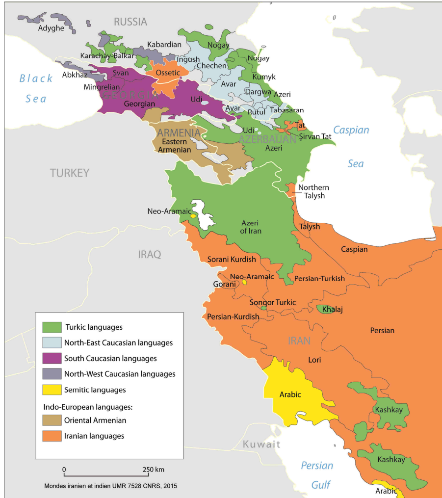
Figure 1: Languages of the Caucasus-Western Iran area