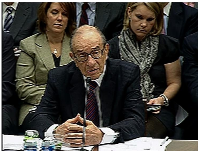
FIGURE 2: Alan Greenspan testifies before Congress, 23 October 2008

In terms of the wider significance of this hearing within the context of the crisis, the crucial concession from Greenspan's testimony is quoted in Larnaudie's text (in French), that he had 'made a mistake in presuming that the self-interests of organizations, specifically banks, were such that they were best capable of protecting their own shareholders and their equity in the firms' (42; Committee 2008: 45). Larnaudie recounts the moment when Waxman asks whether there was a flaw in Greenspan's ideology. Quoted below is the key exchange from the official transcript: